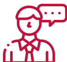
individual consultations with teaching staff