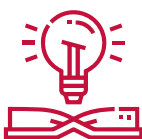
study skills coaching

The Carolina Centre can help you to access the following services: